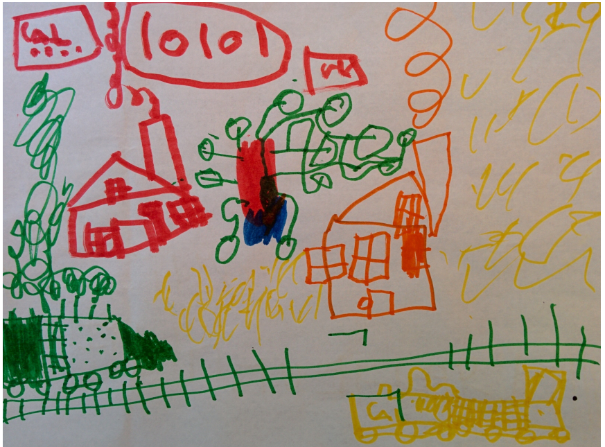
Figure 9.4 – Dessin de Callum