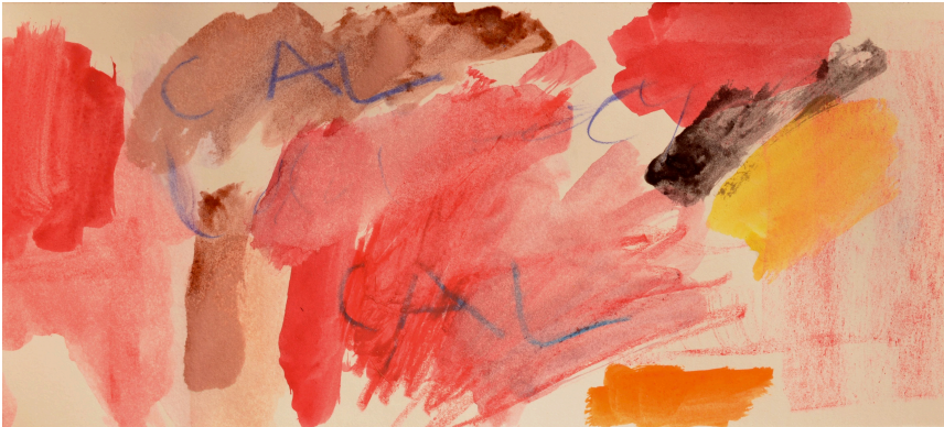
Figure 12.2 – Last page of five-page booklet by Callum