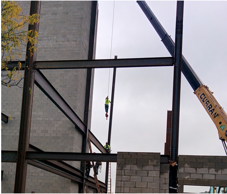
Figure 10.1 – Steel framing, W Nine Mile and Planavon, Ferndale, MI

past technologies required skilled workers and employees. Friedman is optimistic: “Over time some version of this process will presumably play out again.” Granted, complex new tasks are being created, but aren’t they all replicable? What is striking is that an enormous part of human work cannot easily be duplicated or algorithmed out, in spite of efforts to do so: infant care, education of children, care of people who are ill, weak, or in need of comfort and support... The needs do not fit the objectives of modern economics and yet have become the clear goal of any human economy worth its name. “The one job that everyone believes will multiply in the years ahead is nursing home attendant.”