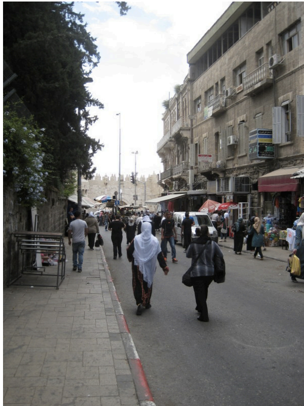
Figure 6.1 – Nablus Road, 2000

I haven't written about Monday the fifth of June 1967 and the adumbrated memories I have of the first days of that week. Not six days. A list of the clearest ones will include: the story of the squad of Jordanian soldiers stationed on the Ottoman wall above the no man's land. So, I realize, first a map . Ottoman and modern walls, some Herodian stones, a jumble of vegetation, poor Jews from Morocco and other Arab countries, where streets and a most expensive real estate now officiate. The high wall near Damascus Gate, on my way either to the Barclay's bank right near, and especially along Nablus road to the EBAF.