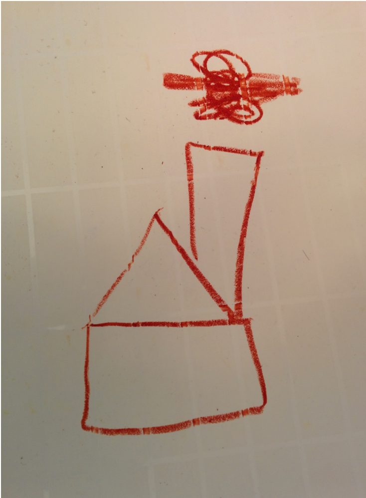
Figure 9.3 – Callum's drawing of a house in the tub

Greco-Roman cities with the purpose of decreasing exploitation and injustice. Its concern seems to be order.