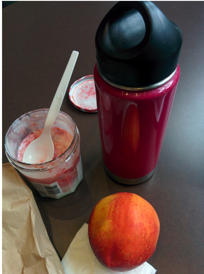
Figure 9.2 – Merenn el levraoueg skol-veur

wonderful to see Callum and Lucie learn French. I've been speaking it more continuously with them, and they take it in stride. The accents are perfect. Lucie gets angry at her maman when she can't go à l'école .