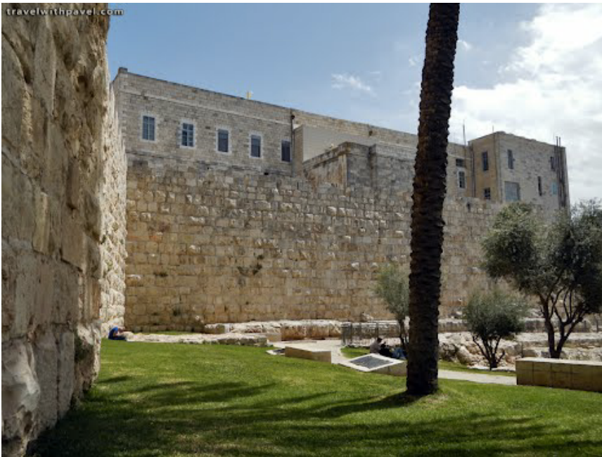
Figure 6.2 – View of the Frères College, 2000, by travelwithpavel.com (Google Earth)

I don't remember anything directly, except a generally shared feeling among the brothers at the Collège des Frères that war was coming, and Israel would soon be occupying East Jerusalem and the region. There was absolutely no doubt about that among all of us. The only question was when, which for us meant a matter of days or even hours. First the practical details: the school year was just over and we had time now to reflect upon the situation in a rather free fashion. The basics of the situation that shaped our understanding of the events to come were simple. First of all, there was our geographic location. We were at the western most corner of the Christian quarter, which is dominated by the Latin patriarchate and the Franciscan order, the Custodians of Catholic interests in the region since the Middle Ages. I shared a room in the main building that looked over the Ottoman wall (right below us) to the 1948 no man's land strip and to the ruined Notre-Dame convent building.